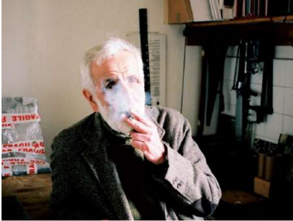
Enzo Mari (1932–2020)