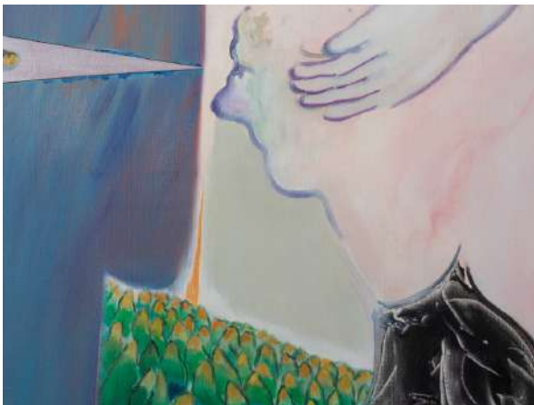
Art Athina Hiroka Yamashita